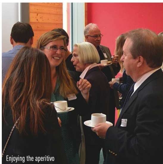
Enjoying the aperitivo