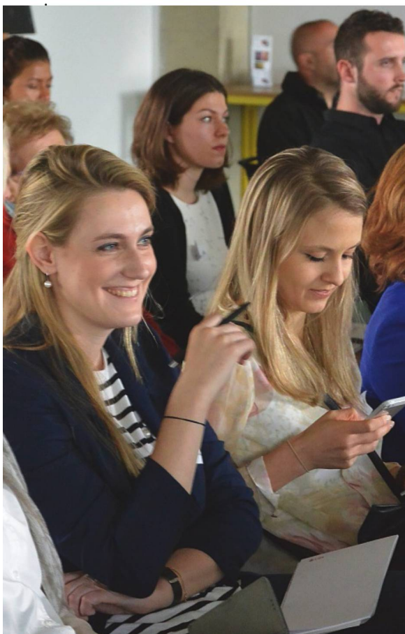
Candidates waiting for the result