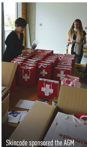
Skincode sponsored the AGM