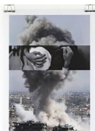
Sir-Taki works