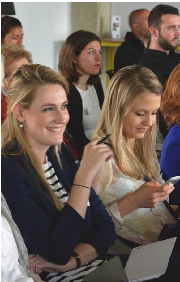
Candidates waiting for the result