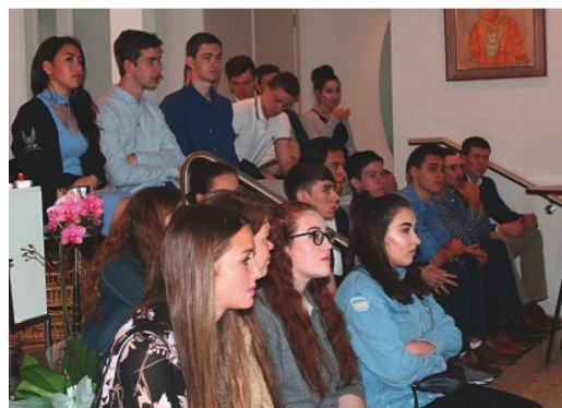
Young adult Swiss at the Consulate General of Switzerland