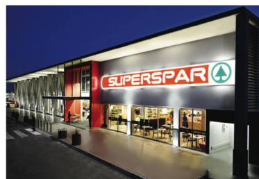
Spar South Africa investing in Switzerland.