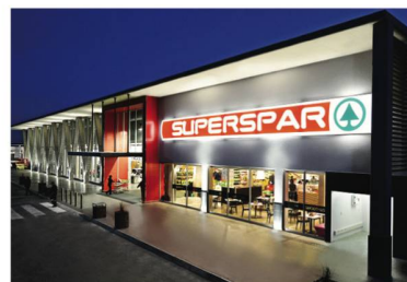
Spar South Africa investing in Switzerland.