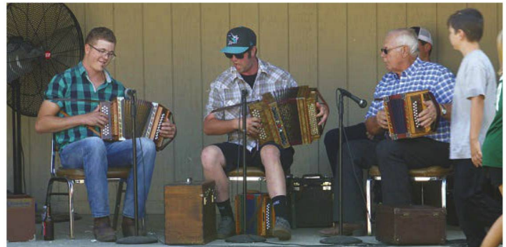
Delightful Swiss music all afternoon.