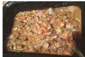
Hirschkleefer and "Swiss" sheet cake

Again, many thanks go to all our members in support of our important activities and I look forward to another great year together.