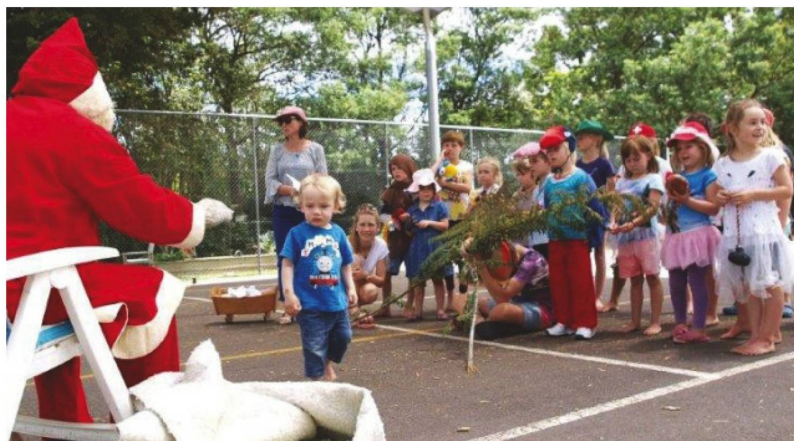
Santa watches the nativity play at Hamilton Christmas party