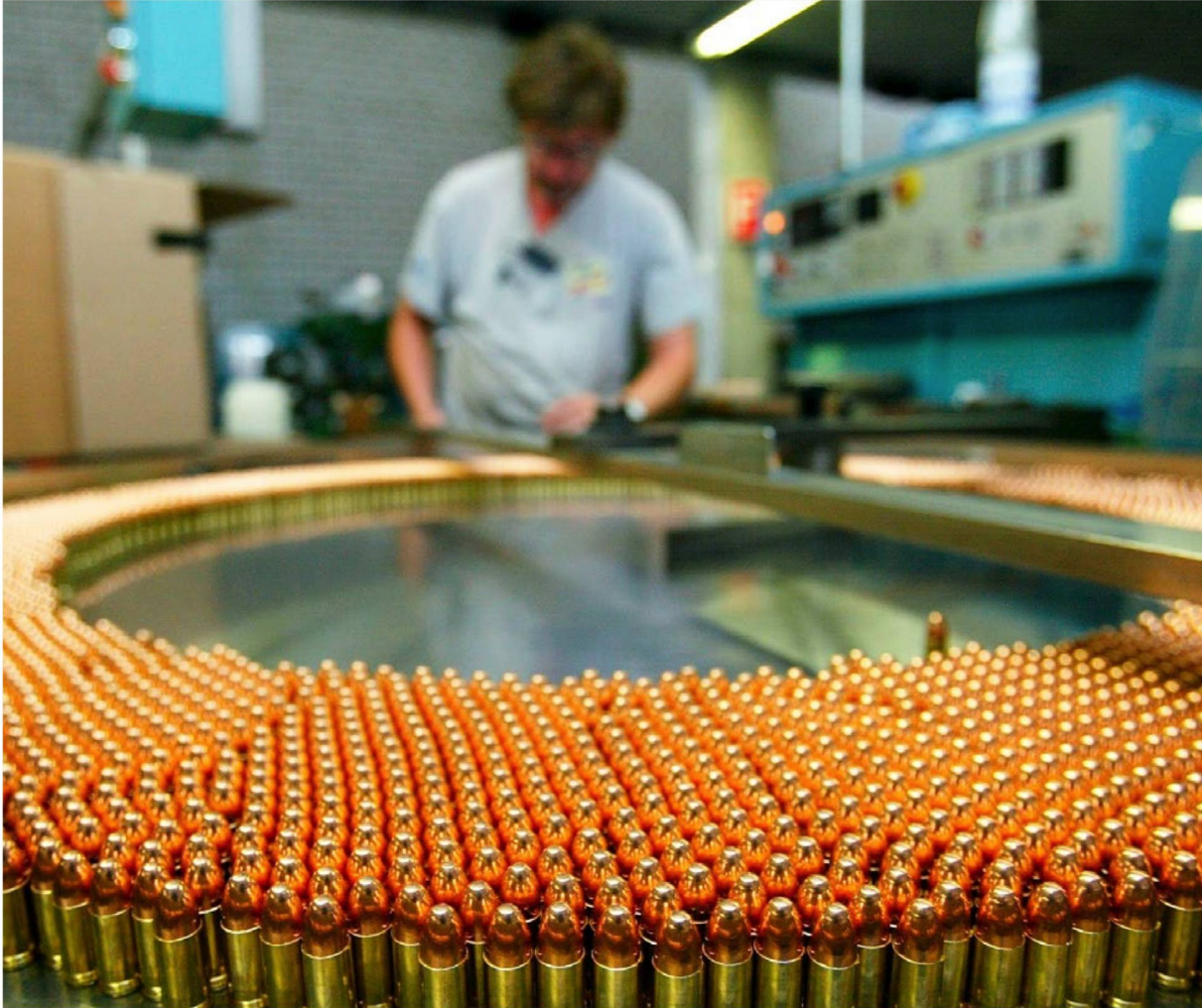
Swiss weapons exports take place in a sphere of conflicting economic, ethical and moral interests. Checking 9-millimetre shells in Ruag's munitions department.

Weapons exports are a long-running political issue in Switzerland. The Yemen conflict has now rekindled the debate and presented the Federal Council with a challenge. A look at the current state of affairs.