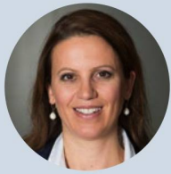
The view of Chantal Galladé , SP National Councillor for the canton of Zurich, member of the National Council's Security Policy Committee: