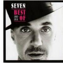
SEVEN: "BEST OF 2002-2016", SONY MUSIC

His soft but equally cool look is familiar to the Swiss, as is his passionate but controlled voice. Seven has been influential in Swiss soul music for years, an equally impressive and contradictory figure, always likeable but somehow unapproachable and impenetrable. For some his brand of soul is movingly beautiful, for others it is too clean-cut and simply too Swiss.