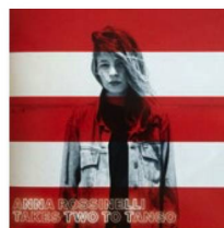
ANNA ROSSINELLI: "Takes Two To Tango", Universal Music.

There was great excitement when Anna Rossinelli announced her new project. She was going to spend three months travelling around the US with her band to do some research into the roots of rock music, to gain inspiration from gospel and blues and to finally go into the studio in New York to immortalise the result in a documentary film and an album.