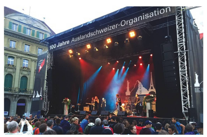
100 years ASO celebration with concerts and activities on the Bundesplatz in Bern

This year, the CSA meeting and OSA congress was particularly interesting . The OSA was celebrating its centenary with a remarkable program. There were concerts on Friday evening and the whole Bundesplatz was dressed in OSA colours. Many information stands and lots of happy people enjoyed what the expat community had on offer. Different groups were presenting themselves and sharing their experience and knowledge. The speech of Bundesrat Didier Burkhalter was also very inspiring.