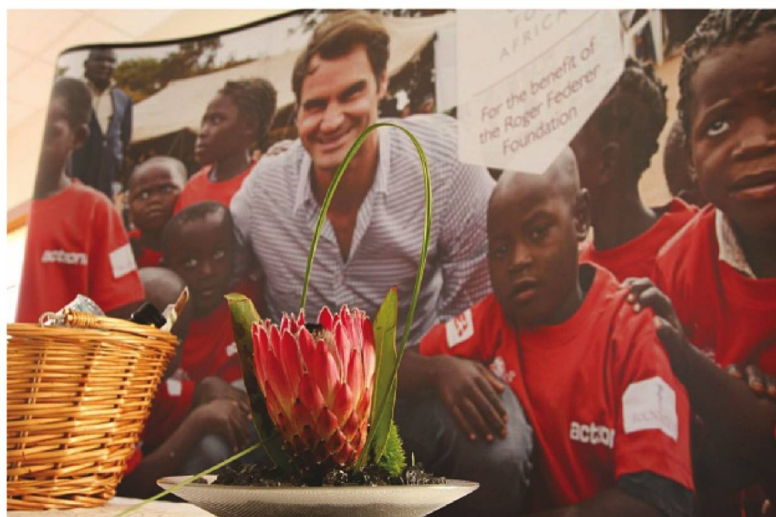
For the first time in South Africa: "Golf for Africa" in the Cape Winelands.