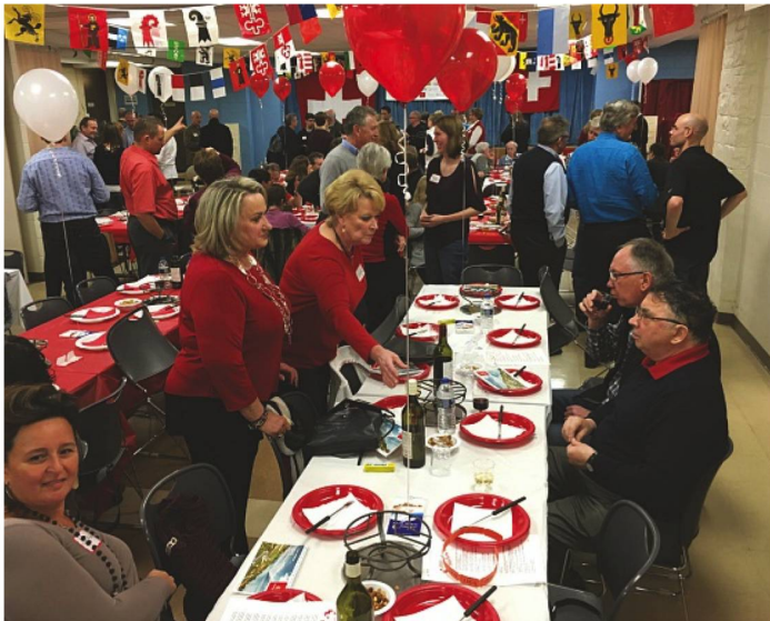
Record breaking attendance at the Annual Meeting and Fondue Dinner held in February.

This year started with a record breaking attendance at the Fondue Dinner and Annual Meeting held in February. That event was followed by the annual Raclette dinner at the Niedersachsen Clubhouse in Chicago; it was another full house. Both events were heavily supported