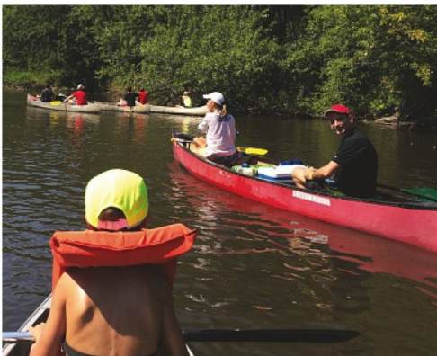
Having fun canoeing on the Sugar River in Wisconsin.