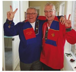
Oklahoma soccer fans