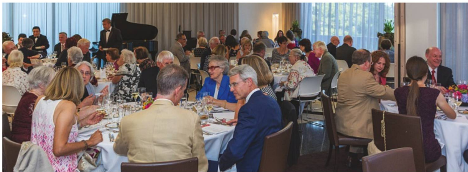
A portion of the beautifully set Dining Room at the Swiss Embassy Residence.