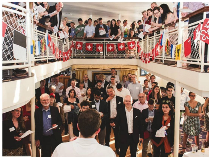
The Swiss National Startup team, a.k.a the Venture Leaders faced their audience in the Boston Harbor.

the Boston harbor. And they had to do it fast: each presenter only had one minute to deliver his or her pitch. The middle of the ocean is as far from the natural habitat of a Swiss as it can be, but the ten helvetic entrepreneurs making up the Venture Leaders Life Sciences Team 2016 stood their ground firmly, standing up to their competitors from the Boston area. A public voting system named three startups – two American, one Swiss – as the winners of the evening.