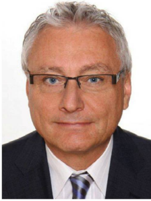
URS V. STRAUSAK, CONSUL GENERAL OF SWITZERLAND, VANCOUVER