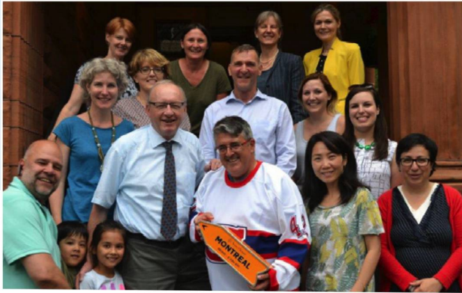
CENTER, HOLDING SIGN: BEAT KASER, CONSUL GENERAL OF SWITZERLAND, MONTREAL