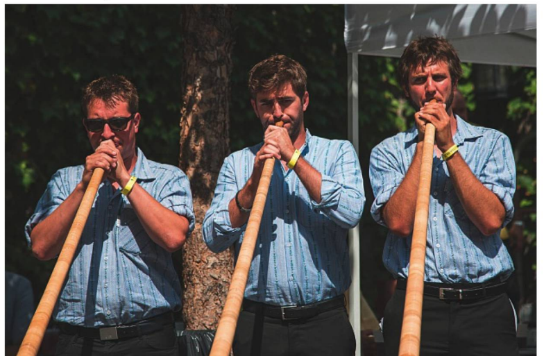
And the Alphorns bring the authentic sound

Next year join us. We welcome Swiss and Swiss fans from all over the world.