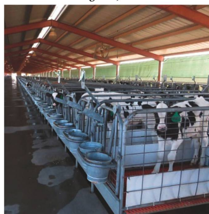
About 400 calves are raised in a separate calf barn..