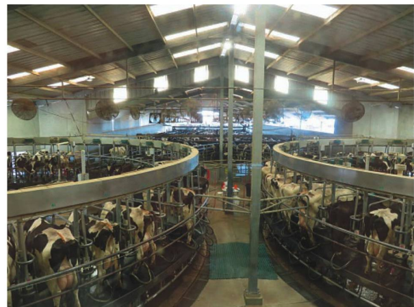
The milking parlor featuring two 48 stall rotary units, also roofed