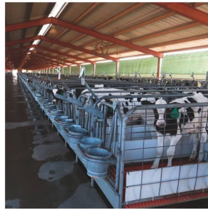
About 400 calves are raised in a separate calf barn..