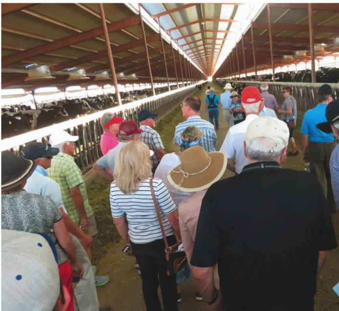
Entering one of the giant, roofed and climate controlled barns

TEXT AND PHOTOS BY ELLEN MUSKATEVC AND MAX HAECHLER SWISSCONSUL@ICLOUD.COM