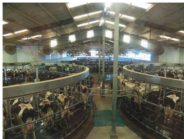
The milking parlor featuring two 48 stall rotary units, also roofed