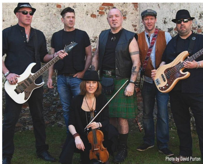
Clan of Celts