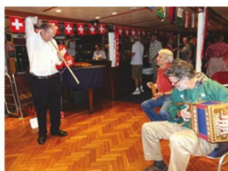
Yodlers Harbour Cruise