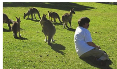
Canberra Swiss Club March long weekend

We also seek your input into our 50th birthday celebration next year. Do you have a memory or story to share? Any ideas how we can celebrate? Your input is much valued! Now we look forward to see you at our bush walk first Sunday in May or at the Fondue in June