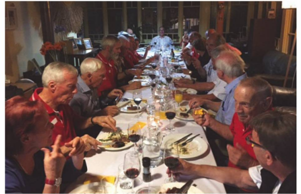
Swiss Yodlers of Sydney: tour party dinner