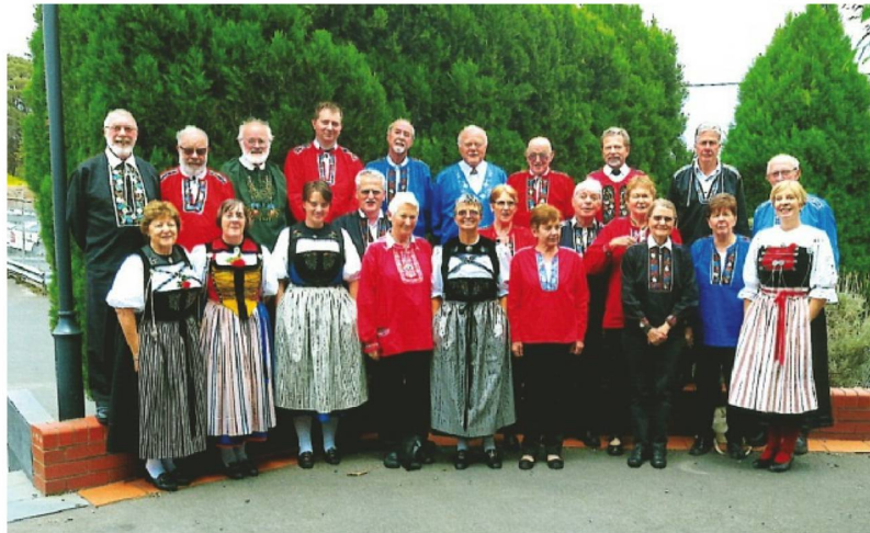
Victoria: Companion Singers and the Swiss Folk Dance group together at the nursing homes

the Companion Singers performed in nursing homes in November as an early Christmas present.