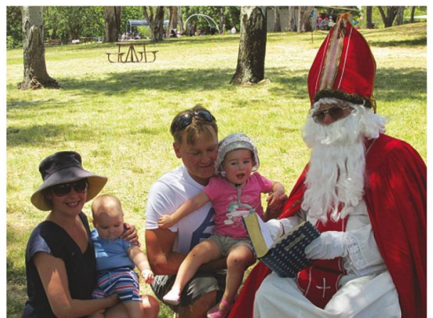
Santa in Canberra

Hopefully you all had a good start into the New Year. Our first event will be a Film night in February. For several years we have been privileged to join the Swiss Jodlers of Sydney on their harbour cruise, so hopefully this year too. Also in February, the Multicultural Festival takes place in Canberra. Usually on Saturday the Swiss and German Radio Programs have a time slot where they broadcast live from the Festival. In March traditionally the Club spends the weekend at the coast.