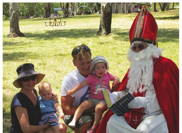
Santa in Canberra

Hopefully you all had a good start into the New Year. Our first event will be a Film night in February. For several years we have been privileged to join the Swiss Jodlers of Sydney on their harbour cruise, so hopefully this year too. Also in February, the Multicultural Festival takes place in Canberra. Usually on Saturday the Swiss and German Radio Programs have a time slot where they broadcast live from the Festival. In March traditionally the Club spends the weekend at the coast.