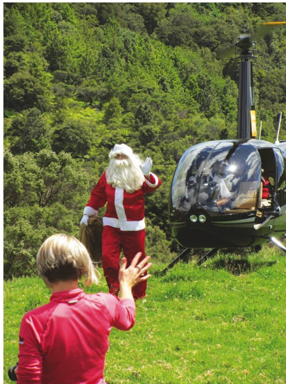
Santa, Auckland style

Monthly Lunch – held on the first Friday of the month. Other venues and details will be published on the Club's website and sent out by email.