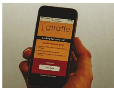
Giraffe is fighting unemployment in South Africa in a modern way.

Modisar (Botswana) : Modisar is a precision livestock farming app that helps to manage farm animals, farm finances and farm resources.