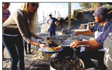
Culinary journey through Cape Town

If you ever feel South Africa is not the coolest place on earth, just take a look at what these Swiss tourists experienced in their travels through the Western Cape. The video “Food Safari Cape Town – Where Food Lovers Dreams come true”