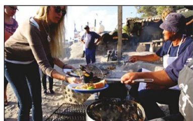
Culinary journey through Cape Town

If you ever feel South Africa is not the coolest place on earth, just take a look at what these Swiss tourists experienced in their travels through the Western Cape. The video “Food Safari Cape Town – Where Food Lovers Dreams come true”