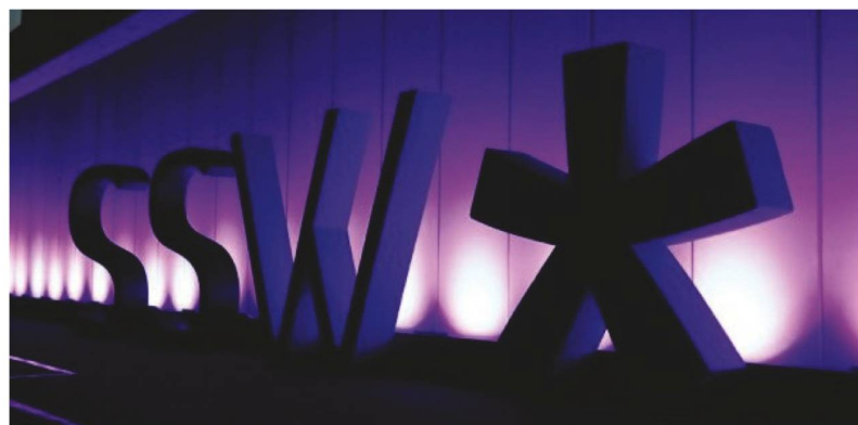
Seedstars connects startups from emerging markets with investors

Hans-Georg Bosch, Delegierter des Auslandschweizerats für das südliche Afrika