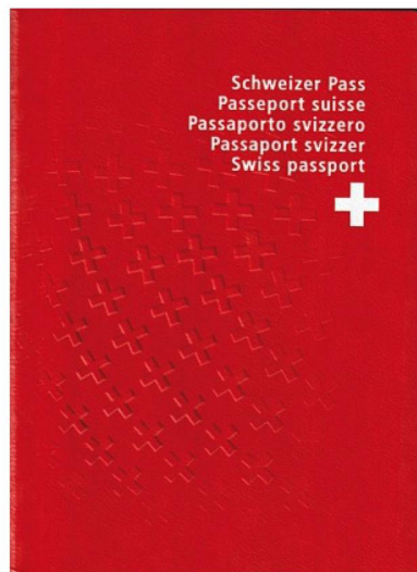
An appointment is required to apply for a new Swiss passport.

To apply for a new passport, applications have to be submitted on www.schweizerpass.ch . Once the application is verified, you will receive an e-mail with a link which gives you access to our calendar. A suitable date and time can then be chosen for an appointment. During the appointment, the biometrics as well as a photograph for the Passport and identity card will be taken. Children must be accompanied by both parents. This procedure can be also done during your visit in Switzerland at any Swiss passport offices. However as most of the Swiss passport offices have a waiting list, we have to contact the passport office in Switzerland before you can make an appointment.