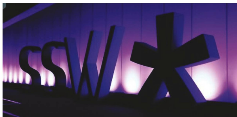
Seedstars connects startups from emerging markets with investors

Hans-Georg Bosch, Delegierter des Auslandschweizerats für das südliche Afrika