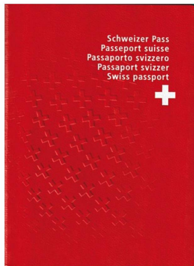
An appointment is required to apply for a new Swiss passport.

To apply for a new passport, applications have to be submitted on www.schweizerpass.ch . Once the application is verified, you will receive an e-mail with a link which gives you access to our calendar. A suitable date and time can then be chosen for an appointment. During the appointment, the biometrics as well as a photograph for the Passport and identity card will be taken. Children must be accompanied by both parents. This procedure can be also done during your visit in Switzerland at any Swiss passport offices. However as most of the Swiss passport offices have a waiting list, we have to contact the passport office in Switzerland before you can make an appointment.