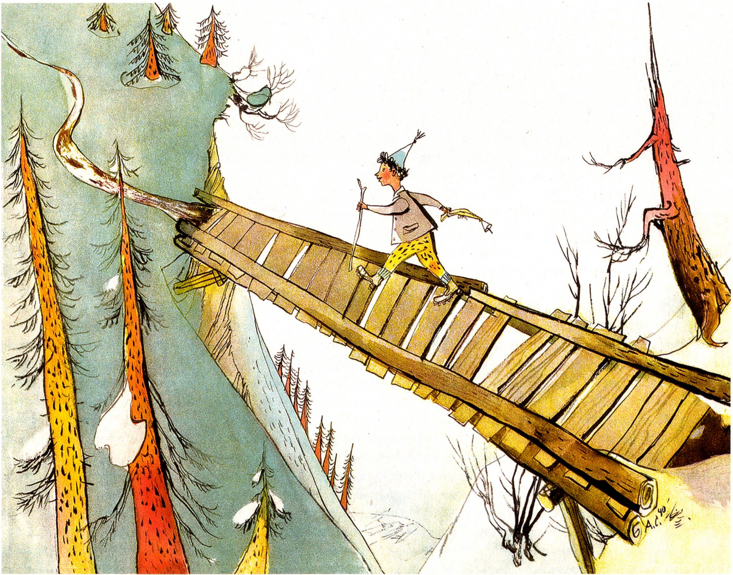
Schellen-Ursli on the way to the alpine hut