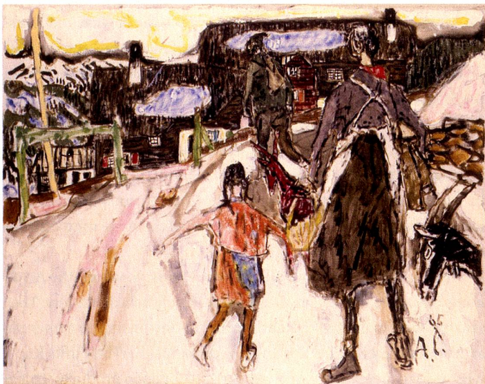
Die Bergbauernfamilie (1965), oil on canvas

Now to mark the 30th anniversary of the death of Alois Carigiet (1902 – 1985) and the 70th birthday of “Schellenursli”, the Swiss National Museum in Zurich is paying tribute to the work of Carigiet. The title of the exhibition “Alois Carigiet. Art, Graphic Art & Schellen-Ursli” underlines that the painter from Grisons deserves just as much acclaim for his work as a graphic artist, set designer and painter as for his illustrated books. In tandem with the exhibition a book entitled “Alois