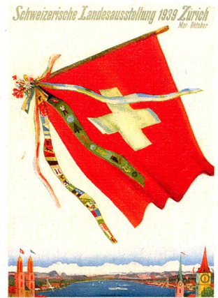
Poster for 1939 national exhibition in Zurich