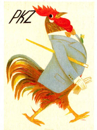
Poster for PKZ (1935)