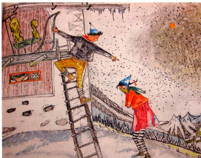
From the book “Flurina and the Wild Bird”