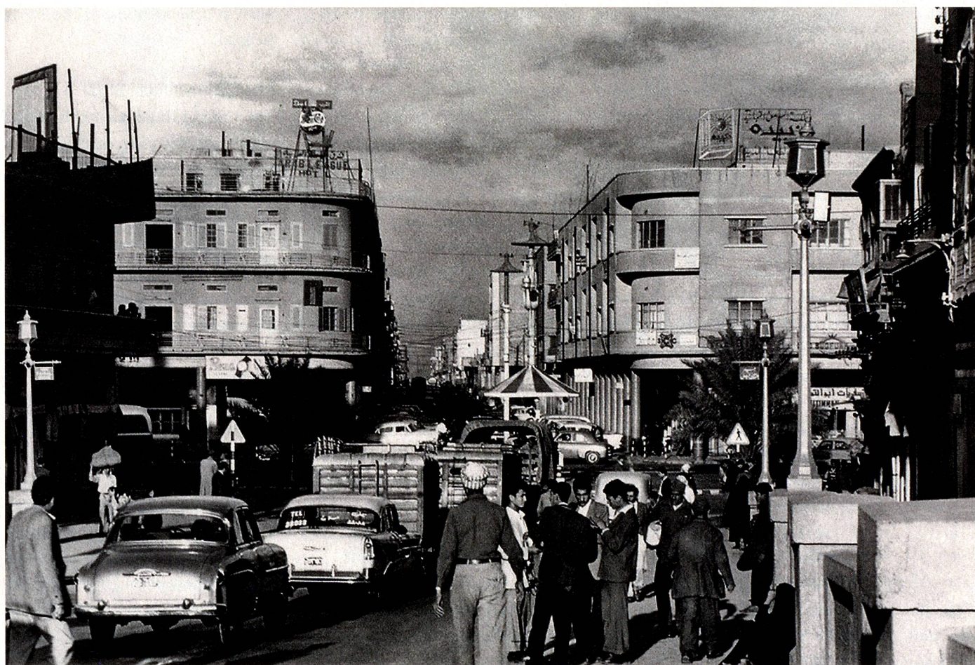
Rashid Street in Baghdad in 1956