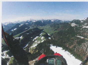
Paraglider at Alpstein

Would you like to go flying in Switzerland? It couldn't be easier, as the country is full of flying schools, clubs and commercial pilots. A trial day with a 10-metre flight costs 120 Swiss francs, according to the SHPA. Paragliding requires a licence, which generally takes one year to obtain in order to allow people to experience flying in various types of weather conditions, according to the association. Training costs around 1800 Swiss francs and full equipment approximately 5000 francs. Flying without a licence is illegal. According to Christian Jöhr, training in Switzerland is strenuous.