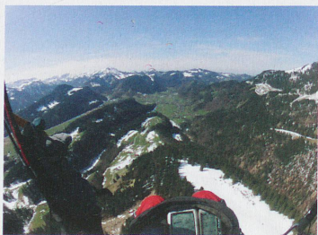
Paraglider at Alpstein

Would you like to go flying in Switzerland? It couldn't be easier, as the country is full of flying schools, clubs and commercial pilots. A trial day with a 10-metre flight costs 120 Swiss francs, according to the SHPA. Paragliding requires a licence, which generally takes one year to obtain in order to allow people to experience flying in various types of weather conditions, according to the association. Training costs around 1800 Swiss francs and full equipment approximately 5000 francs. Flying without a licence is illegal. According to Christian Jöhr, training in Switzerland is strenuous.