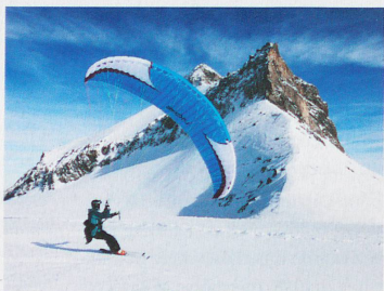
Speed flying is only permitted in a few areas