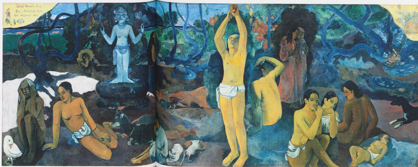
Where Do We Come From? What Are We? Where Are We Going? 1897/98, Museum of Fine Arts Boston