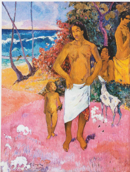
Bathers, 1902, private collection