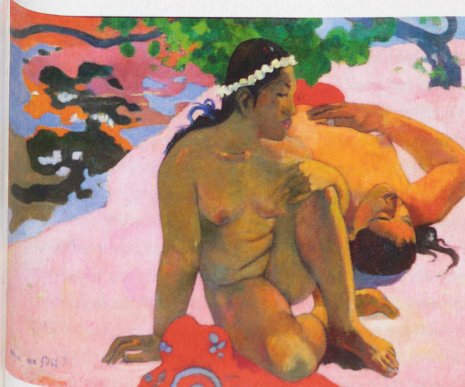
Aha oe feii? What! Are You Jealous?, 1892, Pushkin Museum Moscow