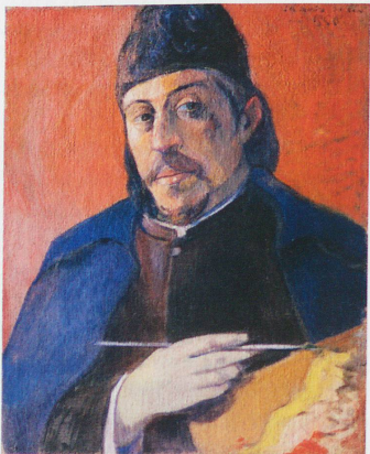
Self-portrait with palette, 1893/94, private collection

Exhibition from 8 February until 28 July 2015, daily from 10 a.m. until 6 p.m., Thursdays until 8 p.m. Information and ticket orders www.fondationbeyeler.ch