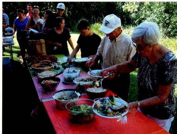
Prince George and area Swiss celebrating Swiss National Day 2015