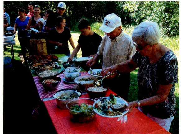
Prince George and area Swiss celebrating Swiss National Day 2015