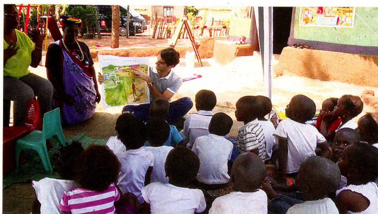
Roger Federer gets hands on in South Africa