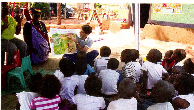
Roger Federer gets hands on in South Africa