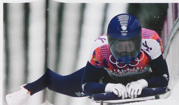
The skeleton at the Olympic Games in Sochi: Gold medal winner Elizabeth Yarnold (GB)