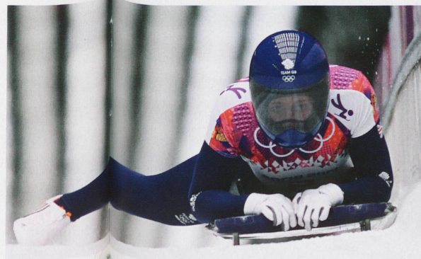
The skeleton at the Olympic Games in Sochi: Gold medal winner Elizabeth Yarnold (GB)

In German-speaking Switzerland, the toboggan has two names: "Schlitten" or "Rodel", which is not the case in French. The first is a basic version, the Davos model, which costs around 200 Swiss francs. It is the toboggan of our memories. You sit or lie on it and off you go. Anyone who has used this timeless classic will testify to its annoying tendency to go straight on despite the bends in the run.