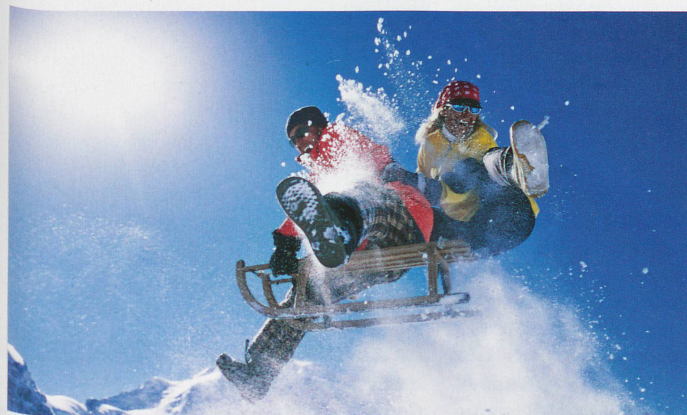
Tobogganing as a fun pursuit for young and old is being heavily promoted by winter sports resorts and mountain railways

Sliding along an icy path or track, alone or in twos, with your head facing forwards or backwards on a fixed or dynamic toboggan – the world of tobogganing is vast!