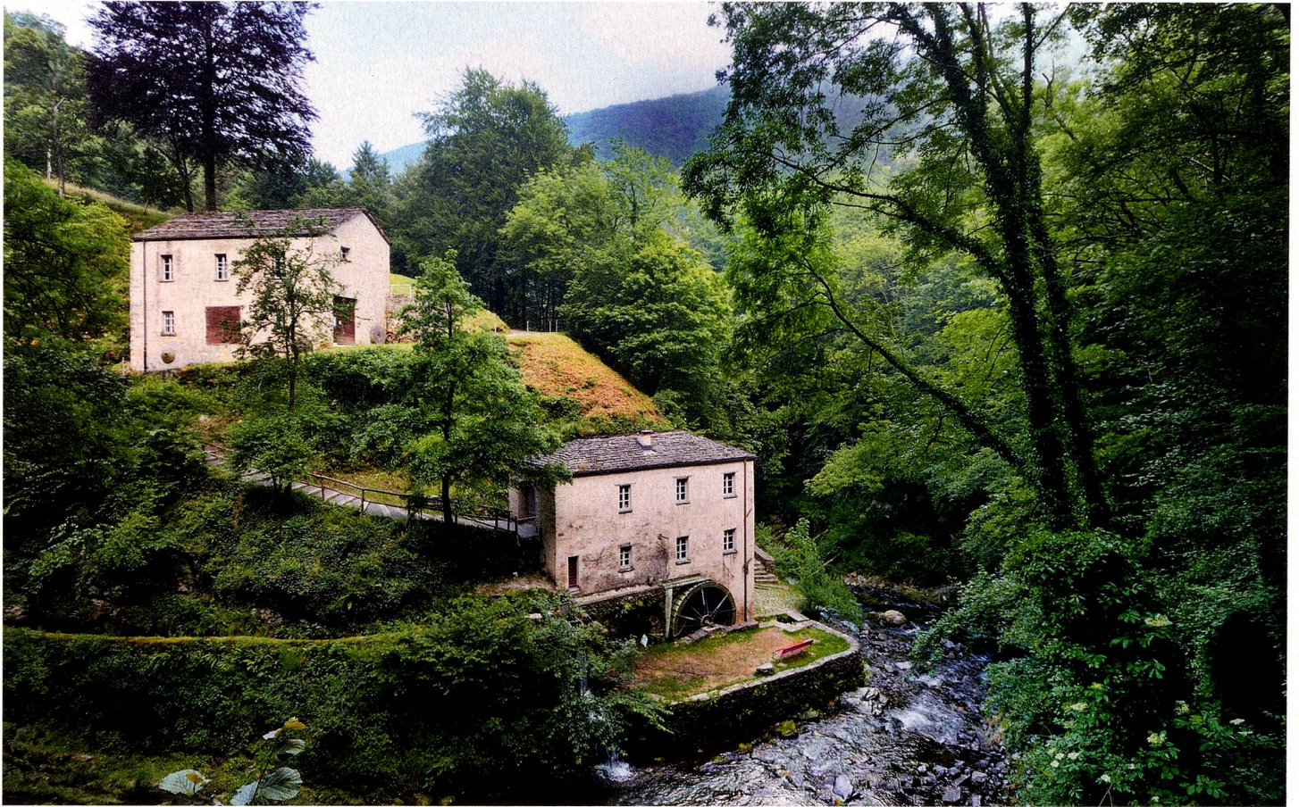
The view from Monte Generoso (left) and the mill at Bruzella

and runs through the centre of the entire valley before entering Lake Como. Here the rock stratifications and ammonite fossils are around 400 million years old. It is very humbling. Upstream the bridge of Castel San Pietro provides a breathtaking view of this geotope of national interest. During the ascent, the forests and villages keep rolling by. Hidden in the deciduous trees in a haven of tranquillity cradled by the Breggia, the watermill at Bruzella is one of the valley's highlights. "In 1983, the museum acquired