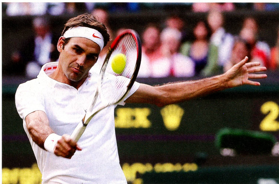
Roger Federer at Wimbledon in 2013

When selecting sponsors, Roger Federer displays his typically well-balanced approach. Of the ten equipment suppliers and sponsors – leaving aside the international brands of Rolex and Credit Suisse – three come from Switzerland: Lindt, insurance company Nationale Suisse and household appliance manufacturer Jura. The question as to whether a company that makes irons is too mundane a partner for an illustrious