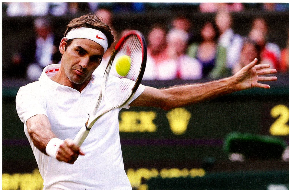
Roger Federer at Wimbledon in 2013

When selecting sponsors, Roger Federer displays his typically well-balanced approach. Of the ten equipment suppliers and sponsors – leaving aside the international brands of Rolex and Credit Suisse – three come from Switzerland: Lindt, insurance company Nationale Suisse and household appliance manufacturer Jura. The question as to whether a company that makes irons is too mundane a partner for an illustrious