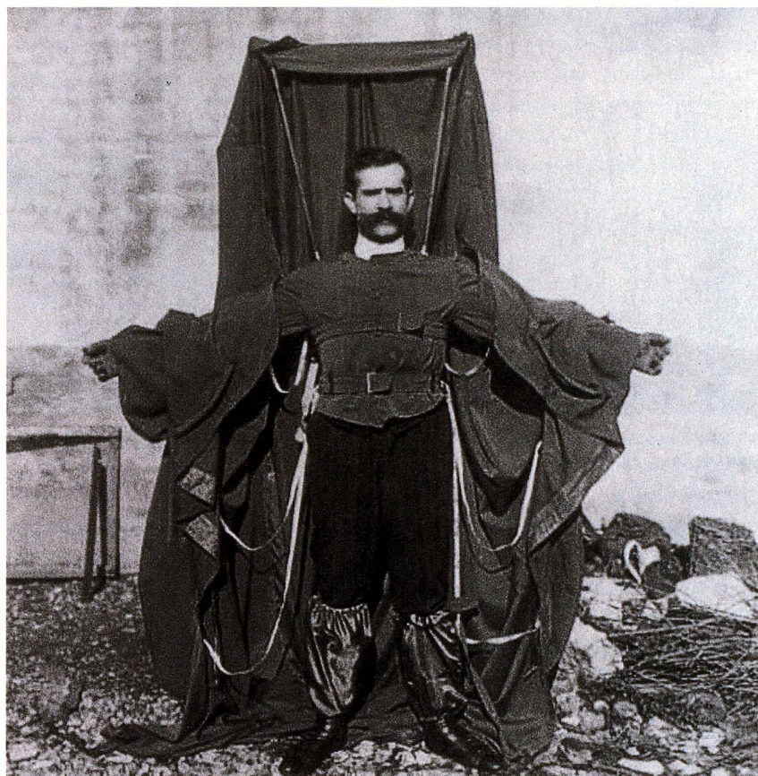
Franz Reichelt in his flying suit – he plunged to his death from the Eiffel Tower on 4 February 1912