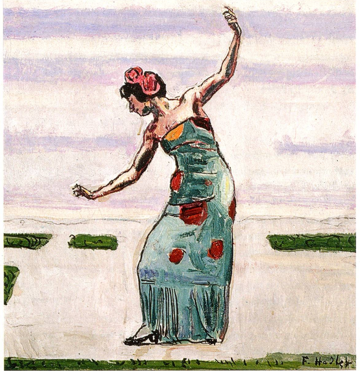
A typical work of art from the period: the "Tänzerin" (Dancer) by Ferdinand Hodler

claimed book "Der taumelnde Kontinent" (The Vertigo Years), which is a vivid and opulent cultural history of the period prior to the First World War. It provided the model for the exhibition in Zurich. Anyone who has not read the book can now step into it, so to speak. And anyone unable to travel to Zurich can enjoy the same experience as a reader - an unconventional, extraordinarily colourful and compact collection of impressions about a turbulent time which cannot be overlooked and is fascinating precisely for that reason.