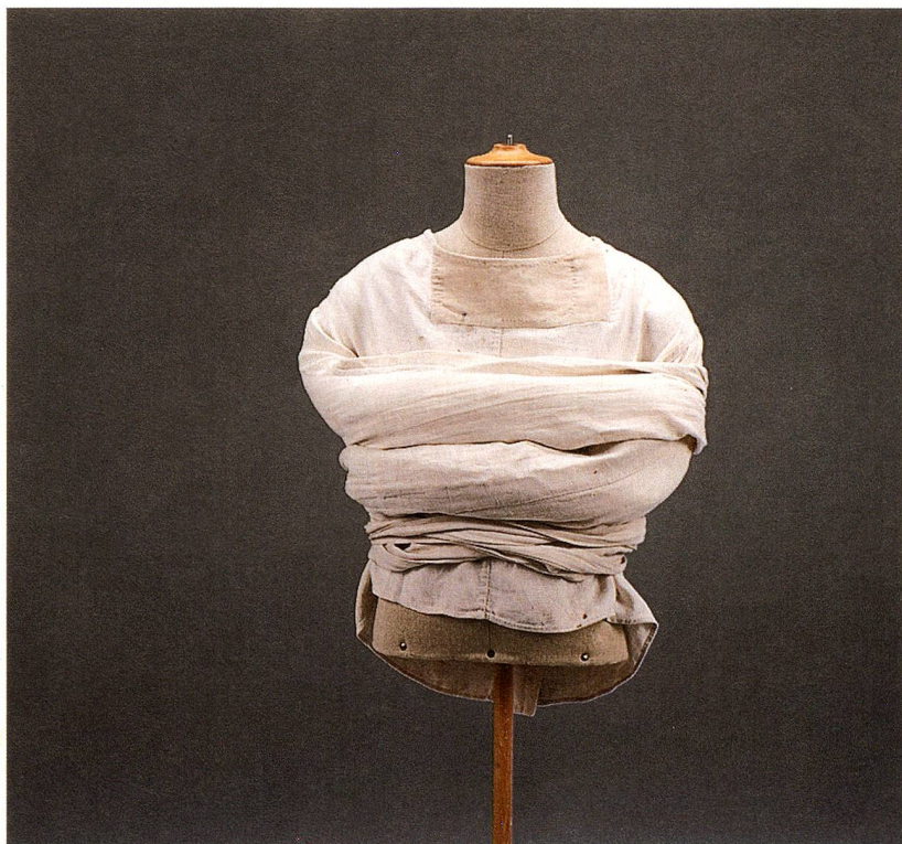
A straightjacket from the Waldau psychiatric hospital near Berne

like Friedrich Engels, a social theorist and close friend of Marx, who had foreseen a “world war of unprecedented scale and severity” as early as 1887: “eight to ten million soldiers will slaughter one another”.