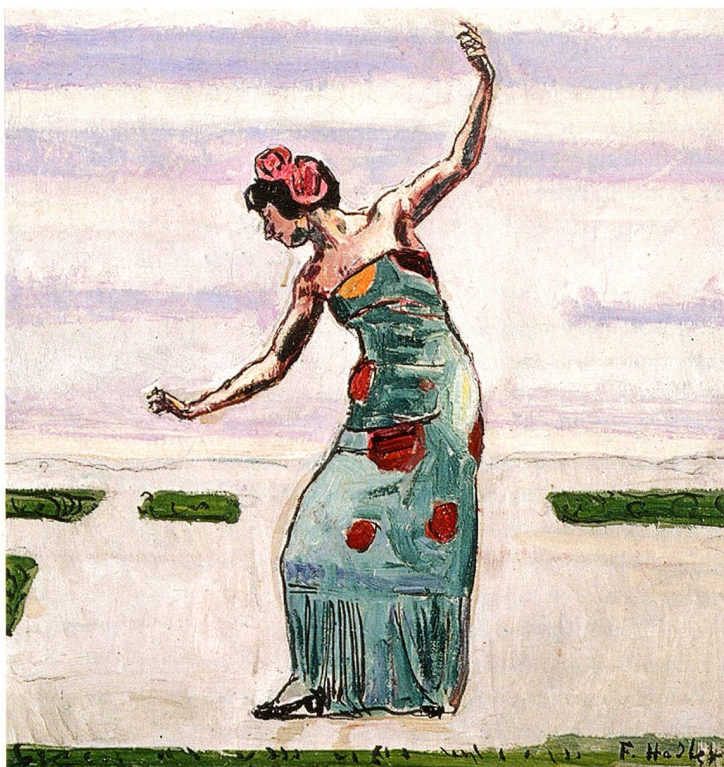
A typical work of art from the period: the "Tänzerin" (Dancer) by Ferdinand Hodler

claimed book "Der taumelnde Kontinent" (The Vertigo Years), which is a vivid and opulent cultural history of the period prior to the First World War. It provided the model for the exhibition in Zurich. Anyone who has not read the book can now step into it, so to speak. And anyone unable to travel to Zurich can enjoy the same experience as a reader - an unconventional, extraordinarily colourful and compact collection of impressions about a turbulent time which cannot be overlooked and is fascinating precisely for that reason.