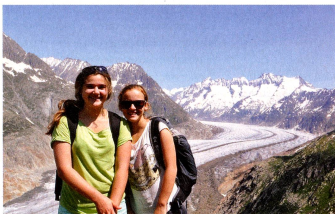
Young Swiss people from abroad visiting Switzerland in the summer of 2013