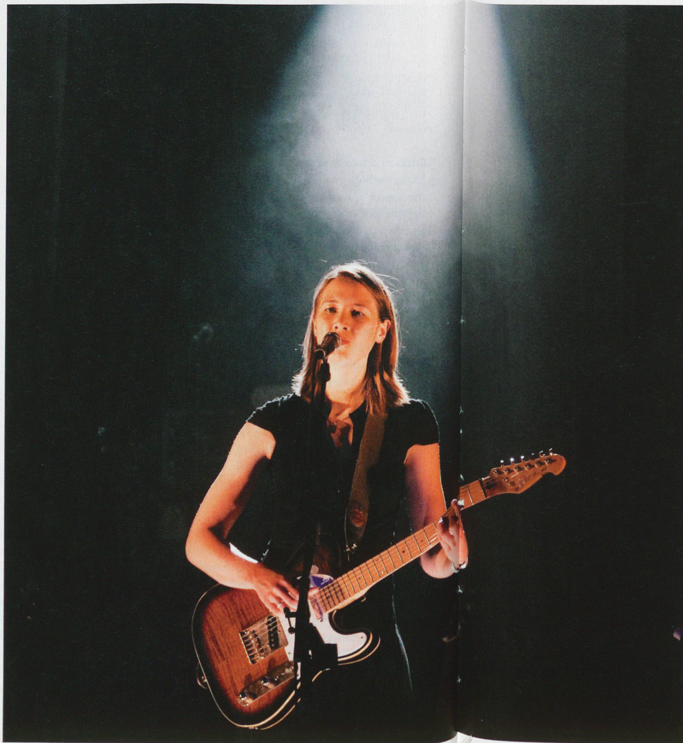
On stage at the Schüür concert hall in Lucerne in 2011