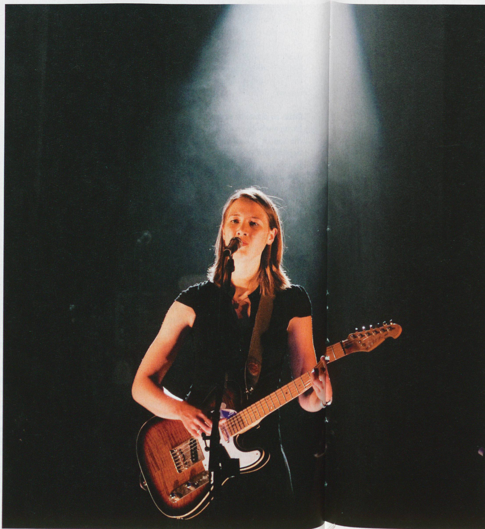
On stage at the Schüür concert hall in Lucerne in 2011