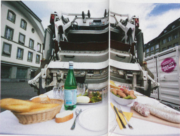
Around a third of Europe's food ends up in the bin. Photo from the "food waste" exhibition in Basel

at least open the lid: "In all likelihood, it will still be perfectly good."