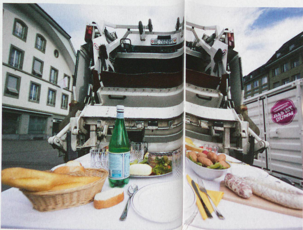
Around a third of Europe's food ends up in the bin. Photo from the "food waste" exhibition in Basel

at least open the lid: "In all likelihood, it will still be perfectly good."