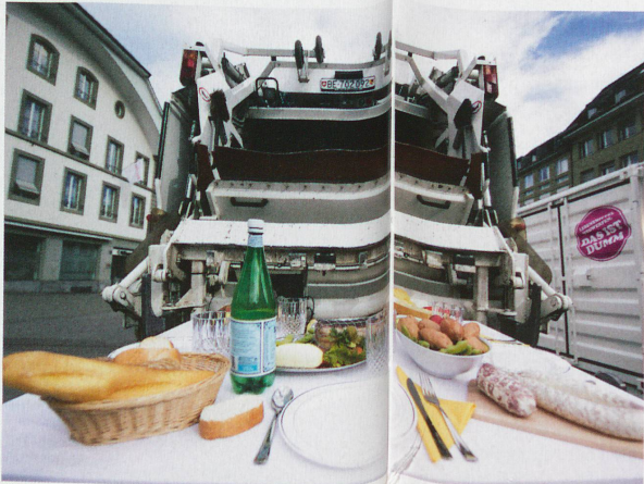
Around a third of Europe's food ends up in the bin. Photo from the "food waste" exhibition in Basel

at least open the lid: "In all likelihood, it will still be perfectly good."