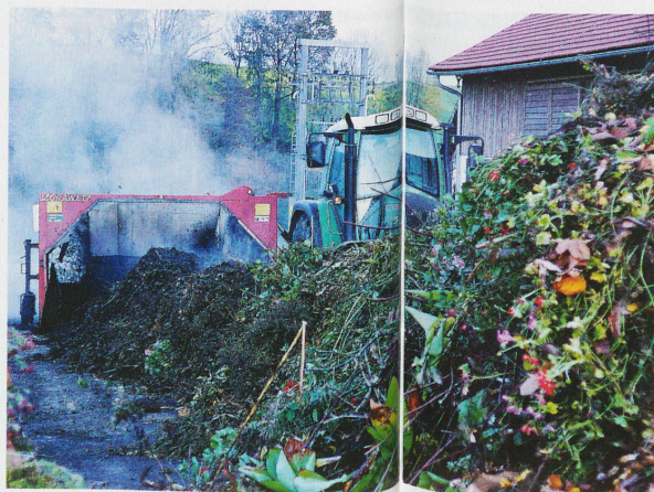
If disposed of properly, the huge amounts of green waste produced in gardens and kitchens becomes compost for the garden