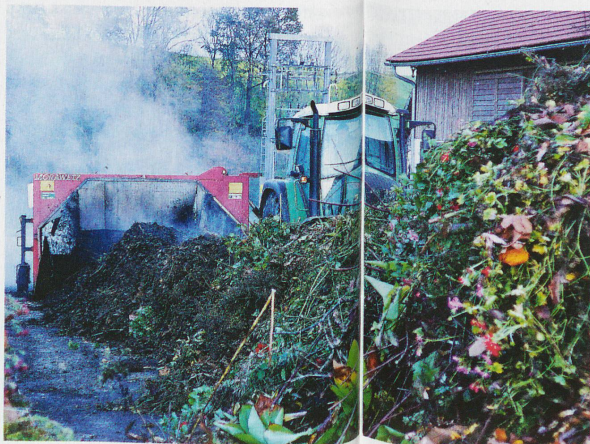
If disposed of properly, the huge amounts of green waste produced in gardens and kitchens becomes compost for the garden