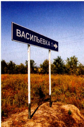
Basel, now Vasilyevka: Russia Founded: 20 August 1767 Population when founded: 166 Neighbouring villages on the Volga: Glarus, Lucerne, Zug, Schaffhausen, Unterwalden, Solothurn, Zurich, all founded 1767/1768