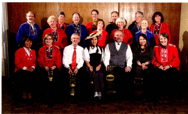
'Crèmeschnitte Chörli' Canberra Swiss choir

Spring in Canberra is an exciting time for soul and mind. It marks the end of winter and gives way to a season full of colours in 'Floriade', the flower festival bringing new life into the city. This is a fabulous time of the year. But that's not all, we have more reason to celebrate. The German Choral Festival 'Sängerfest 2014' is held for the first