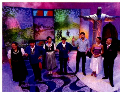
Swiss Dance off

It was much fun, tiring too, but with our traditional outfits we looked the part at all times.