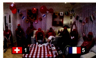
Swiss Dance Fan Tube at Bruno's