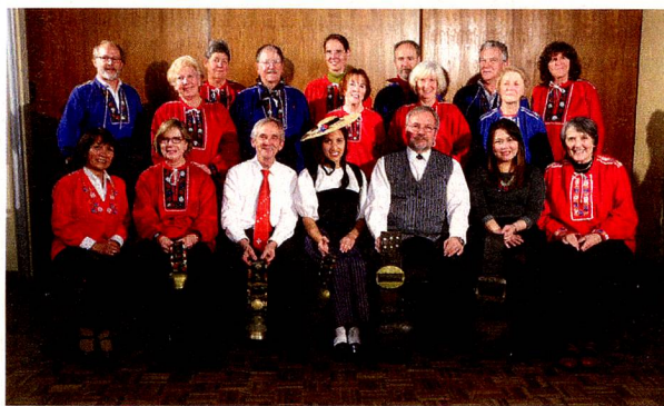
'Crèmeschnitte Chörli' Canberra Swiss choir

Spring in Canberra is an exciting time for soul and mind. It marks the end of winter and gives way to a season full of colours in 'Floriade', the flower festival bringing new life into the city. This is a fabulous time of the year. But that's not all, we have more reason to celebrate. The German Choral Festival 'Sängerfest 2014' is held for the first