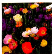
Floriade in Canberra