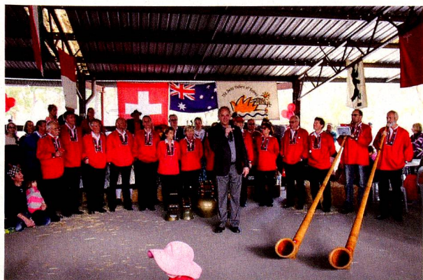
Swiss Yodlers of Sydney

On 29 November, we will perform at the Senior's lunch at the Concordia Club in Tempe.