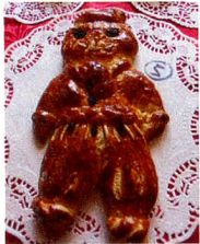
Samichlaus with Grittibänz, Fraser Coast

Our National day at the Samford Showground was a great success. We have vacated the clubhouse at 36 Austin St, New Farm, and currently looking for new suitable premises.