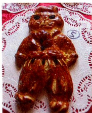
Samichlaus with Grittibänz, Fraser Coast

Our National day at the Samford Showground was a great success. We have vacated the clubhouse at 36 Austin St, New Farm, and currently looking for new suitable premises.