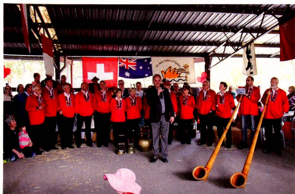
Swiss Yodlers of Sydney

On 29 November, we will perform at the Senior's lunch at the Concordia Club in Tempe.