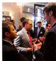
SwissCham EuroMix Eat, Meet & Greet in Sydney and Melbourne 10 & 17 Sept 2014