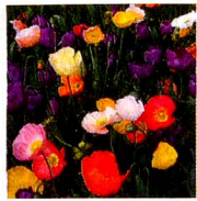
Floriade in Canberra