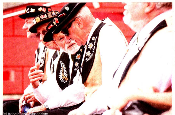
Impressions Swiss Festival 2014, Melbourne