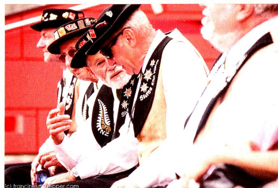
Impressions Swiss Festival 2014, Melbourne