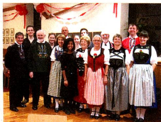
Unterhaltungsabend @ the Swiss Club

Trachtengruppe Schwyzgruess / Australian Swiss Cultural Soc. (contact Silvia Hochuli - as above)