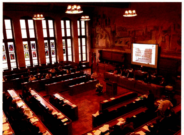
CSA Spring Meeting in the Rathaus in Bern, March 22, 2014.

phone +41 44 466 9000 fax +41 44 461 9010 www.swiss-moving-service.ch info@swiss-moving-service.ch