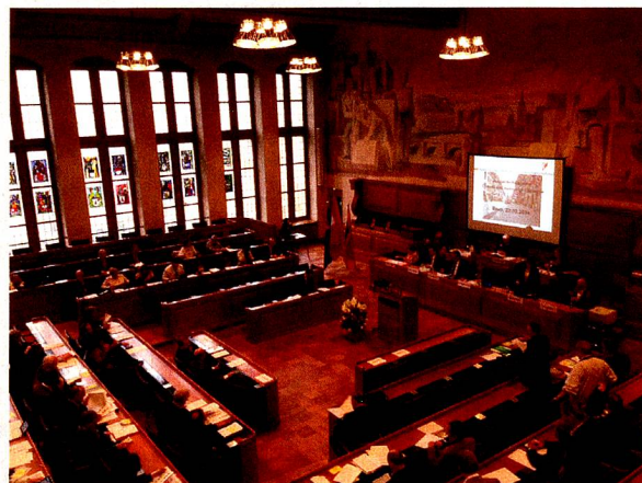
CSA Spring Meeting in the Rathaus in Bern, March 22, 2014.

phone +41 44 466 9000 fax +41 44 461 9010 www.swiss-moving-service.ch info@swiss-moving-service.ch