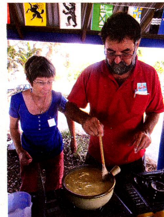
Join us at the "Cheese fondue with Koalas", Fraser Coast Swiss Group