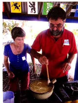
Join us at the "Cheese fondue with Koalas", Fraser Coast Swiss Group