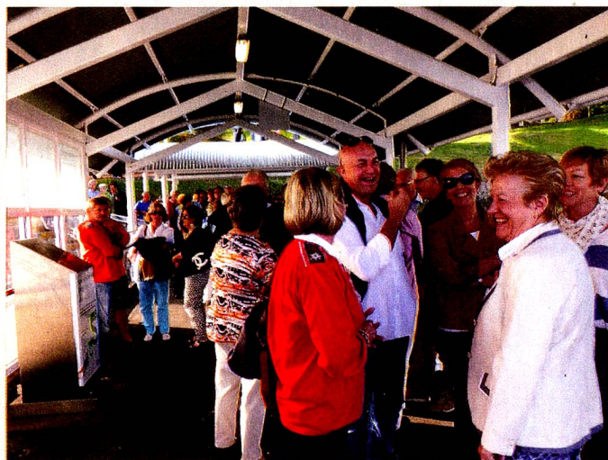
Annual Harbour Cruise, Swiss Yodellers of Sydney