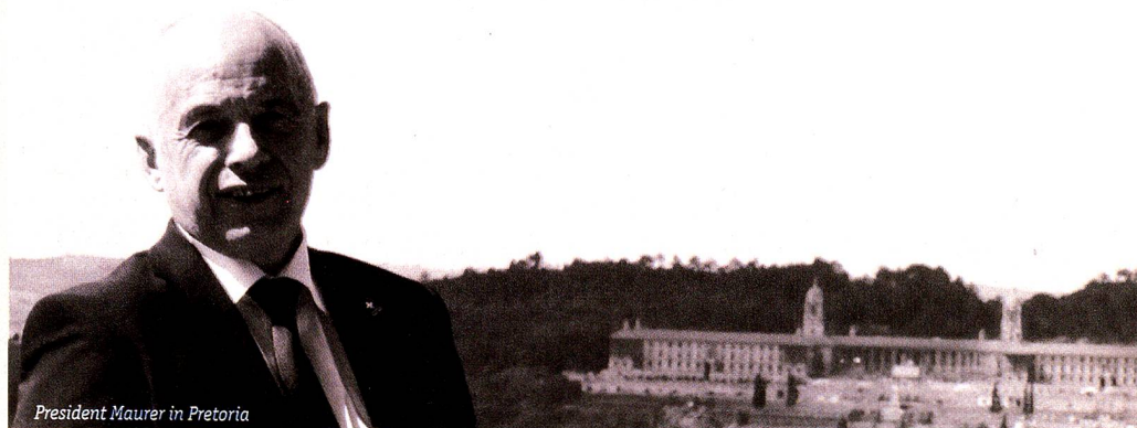
President Maurer in Pretoria