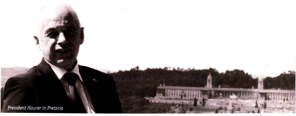
President Maurer in Pretoria