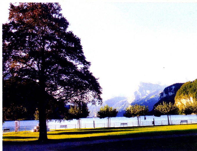
Fighting to retain the value of the Auslandschweizerplatz in Brunnen