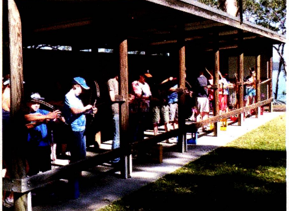
Swiss Folk Dance Group Alpenguess of NSW having a go at archery at their sports and recreation camp weekend.

Dear Compatriots in Australia, Kiribati, Nauru, Papua New Guinea, Solomon Islands and Vanuatu. The Swiss-Australian relations had a high-light with the visit of Federal Councilor Didier Burkhalter to Canberra on the 27th and 28th of October last year. Mr Burkhalter was the first Minister of Foreign Affairs to be welcomed