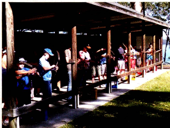
Swiss Folk Dance Group Alpenguess of NSW having a go at archery at their sports and recreation camp weekend.