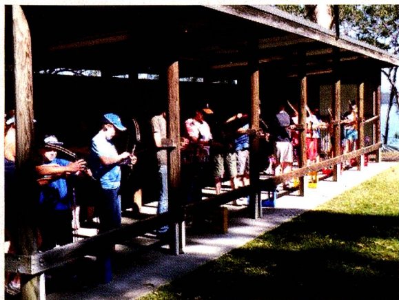
Swiss Folk Dance Group Alpenguess of NSW having a go at archery at their sports and recreation camp weekend.