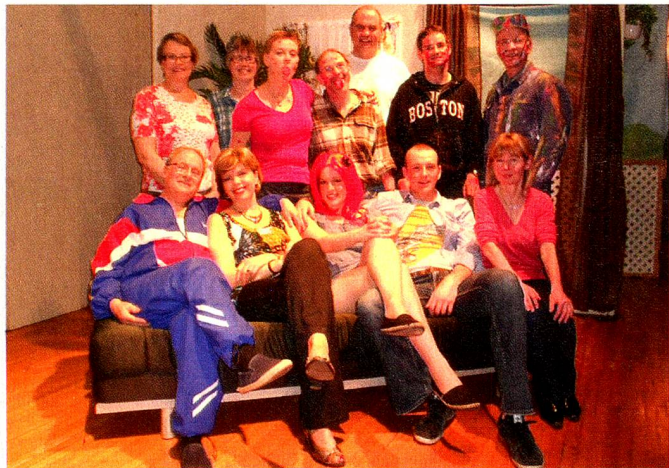
We are looking forward to seeing you at one of our performances!