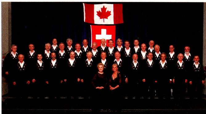
Edmonton Swiss Men's Choir (and two lovely ladies)

The dates for our next two events will be announced in late January. These are the ever popular Raclette luncheon at the home of