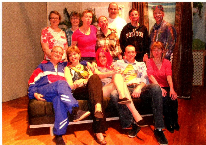
We are looking forward to seeing you at one of our performances!