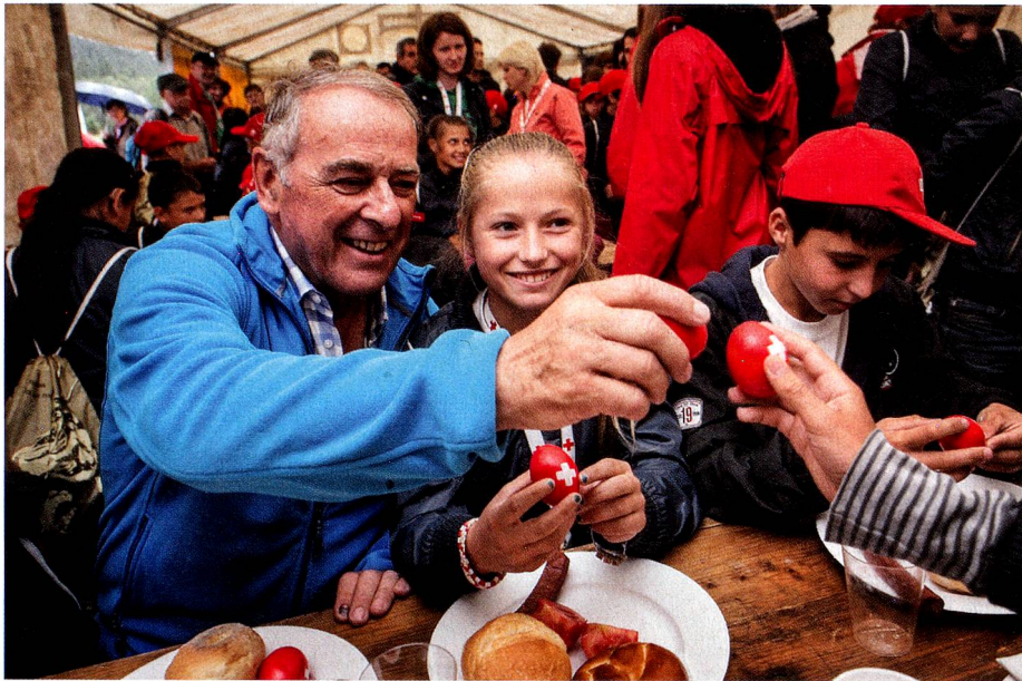
Adolf Ogi with children from Eastern Europe who receive medical care thanks to the Swisscor foundation

You sometimes have to observe things at a sufficient distance. For example, in summer 1992, NASA's space shuttle Atlantis sped around Earth 127 times. Claude Nicollier, Switzerland's first and only astronaut to date, was aboard. It was a big step for Nicollier and a giant step for Swiss space travel. The shuttle hurtled around the planet at 30,000 kilometres an hour. It is just that what Nicollier did in the freezing depths of outer space left no mark on Switzerland's collective consciousness. In contrast, the words that Federal Councillor Adolf Ogi shouted to Nicollier through the ether on 7 August 1992 via a sophisticated radio link remain etched in the mind: "Freude herrscht, Monsieur Nicollier!" (Joy abounds, Monsieur Nicollier!) – the words of congratulation immediately became a turn of phrase. Quoted thousands of times, it has become part of Swiss German vocabulary. Joy is even more wonderful when it not only exists but is ubiquitous, when "joy abounds".