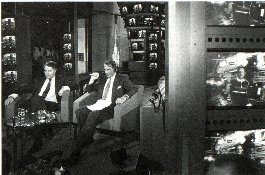
During the direct link-up with Claude Nicollier in the Atlantis space shuttle in August 1992

Swisscor is Ogi's social legacy from his Federal Council days. The "Freude herrscht" (Joy Abounds) foundation, which he also founded, combines social and sporting aspects. This institution aims to encourage children to participate in sport and exercise.