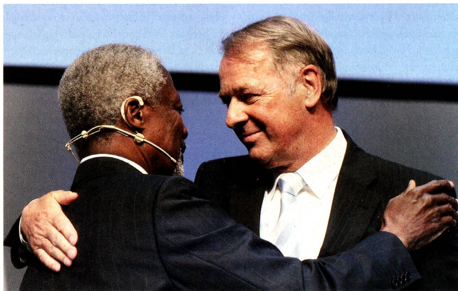
Embracing former UN Secretary-General and friend Kofi Annan at the WEF in Davos in 2007