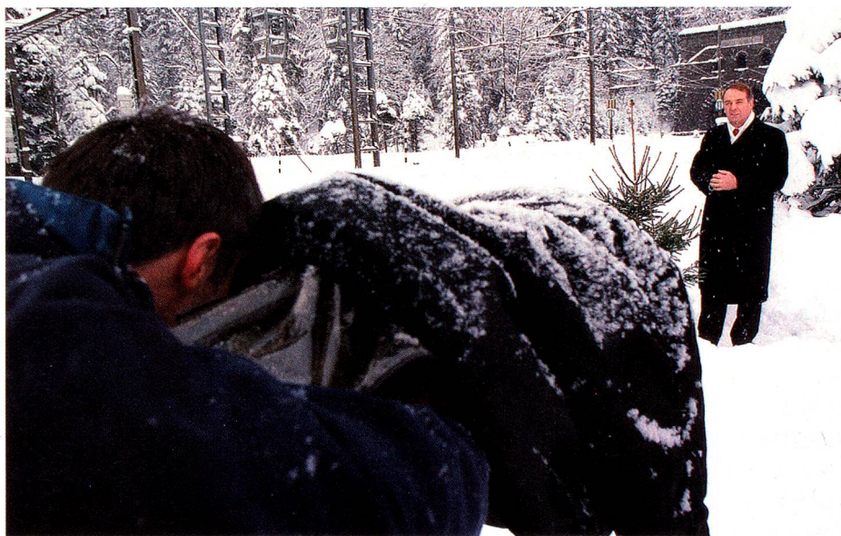
New Year's address as Swiss President in front of the Lötschberg tunnel in Kandersteg in December 1999