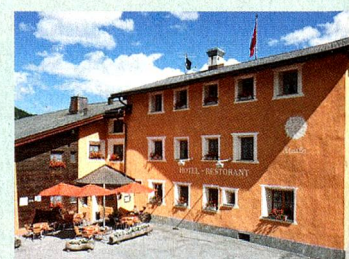
MySwitzerland.com Webcode: A54633

Register by 30 September 2013 at www.MySwitzerland.com/aso and win a 2-night stay for 2 persons at the Typically Swiss Hotel Landgasthof Staila*** in Fuldera for a memorable stay in Val Müstair.