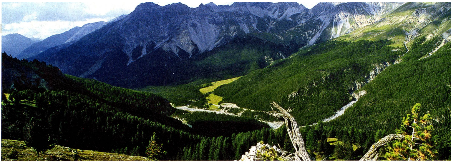
Swiss National Park, Graubünden