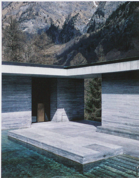
The newly built Vals thermal baths, designed by the architect Peter Zumthor, opened in 1996, photographed by Hélène Binet