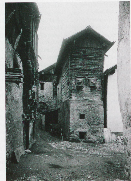
House in Zuoz