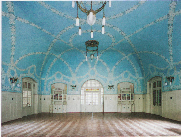
The dining- and ball room of the Bergün casino which opened in 1906, photographed by Ralph Feiner in 2009

The exhibition: until 12 May 2013 at the Grisons Museum of Art in Chur. www.buendner-kunstmuseum.ch The book: "Ansichtssache", 150 Jahre Architektur-fotografie in Graubünden. Edited by Stephan Kunz and Köbi Gantenbein; Verlag Scheidegger & Spiess/Bündner Kunstmuseum, 384 pages; CHF 58, EUR 48.