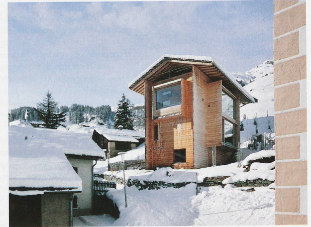
A house built by the architect Peter Zumthor in Leis