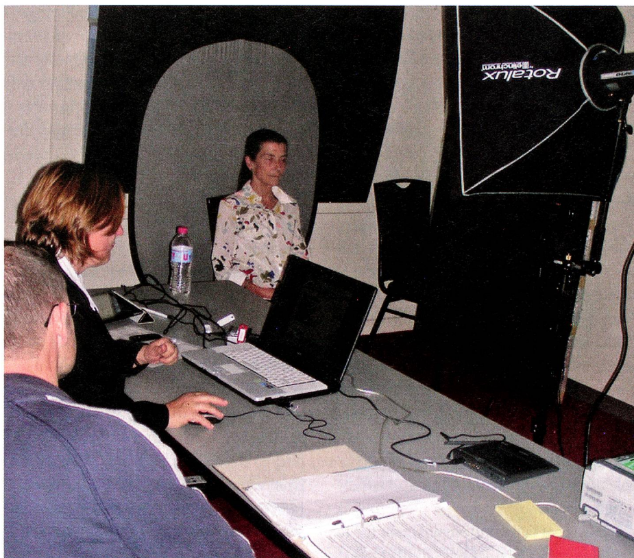
Swiss citizens having the data required for a new passport recorded by the mobile unit