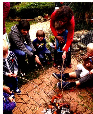
Children & parents grilling servelat am Spies at our August Playgroup!