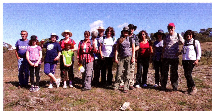
Members of the Canberra Swiss Club before the walk to London bridge at the upper end of Googong dam

22/6 Fondue, North Perth Bowling Club (please check our website for updates)