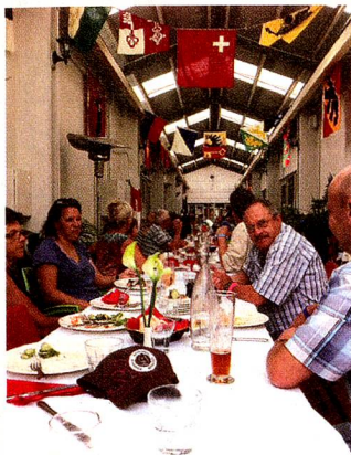
Swiss Club of WA: A lot of fun and laughter at the inaugural Swiss Festival!