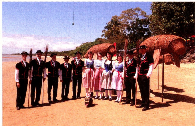
Baerg-Roeseli at the Fraser Coast Festival, Hervey Bay