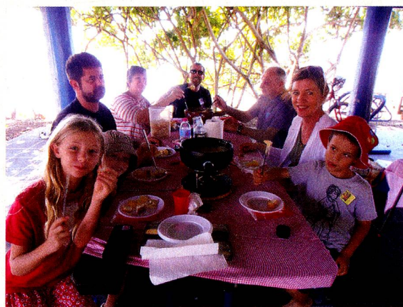
Swiss Fondue at the Beach. Fraser Coast Swiss Group, QLD

phone +41 44 466 9000 fax +41 44 461 9010 www.swiss-moving-service.ch info@swiss-moving-service.ch