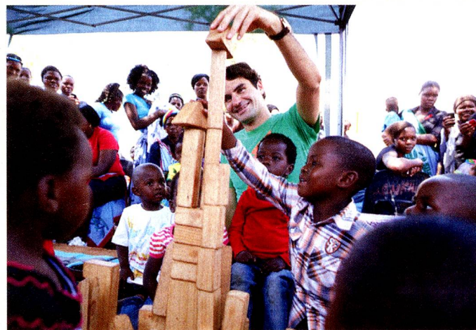
14000 children in South Africa alone benefit from the Federer Foundation.