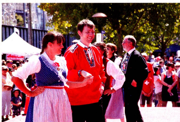
Folk Dance Group Alpenrose @ the Swiss Festival