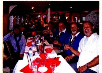
Yodelers @ Harbor Cruise