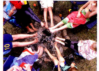
Upper Colo River Camping weekend

We are a group of Swiss/Australian, Swiss/International families that get together every first Sunday of the month from 11am.