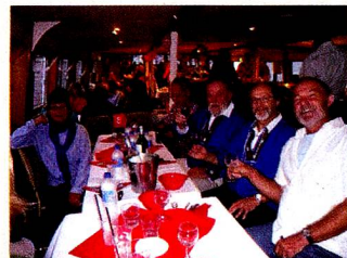
Yodelers @ Harbor Cruise