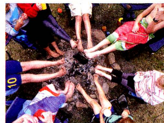
Upper Colo River Camping weekend

We are a group of Swiss/Australian, Swiss/International families that get together every first Sunday of the month from 11am.