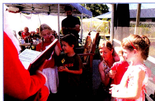
Santa visiting the Fraser Coast in Queensland