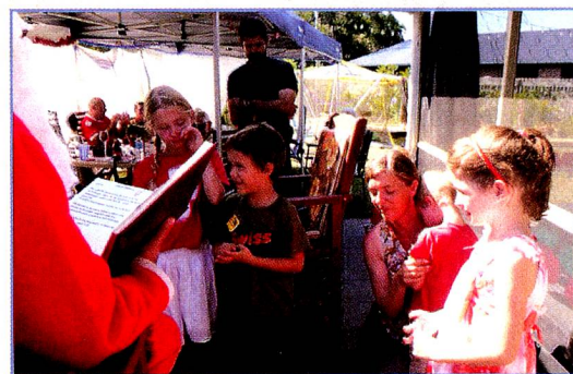
Santa visiting the Fraser Coast in Queensland