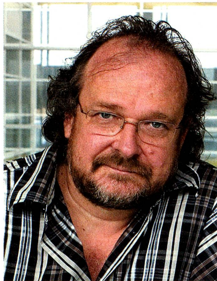
Creator of "Swatch": Elmar Mock