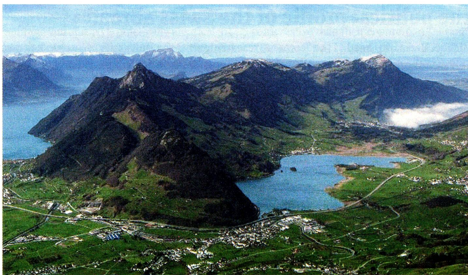
View of the Rigi from the “Mythen”