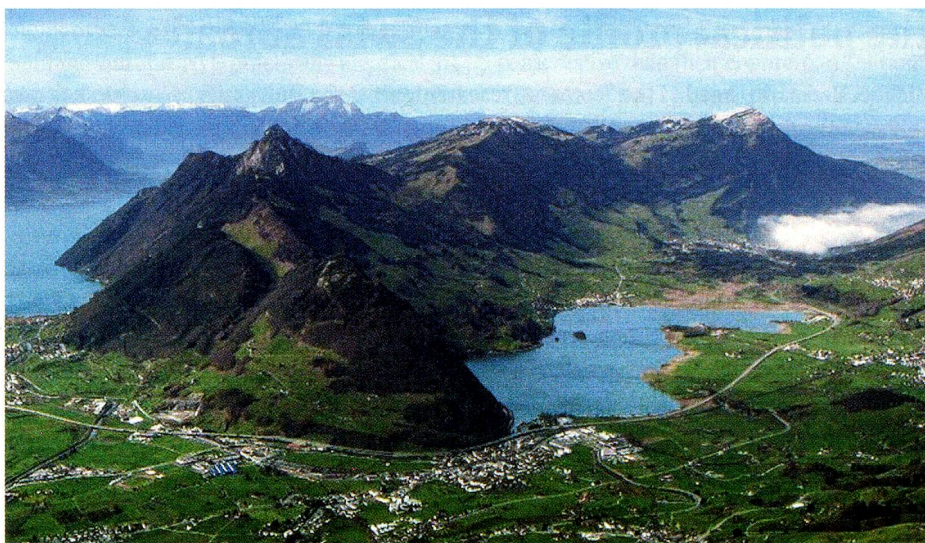
View of the Rigi from the “Mythen”