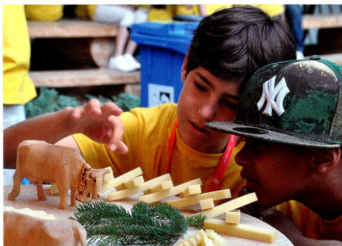
Happy times at past summer camps run by the Foundation for Young Swiss Abroad

possible. We therefore offer reduced camp rates. The relevant application form can be requested with the registration form.