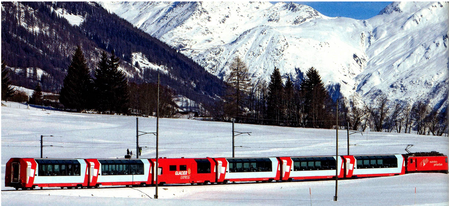
Glacier Express in the Goms Valley, Valais